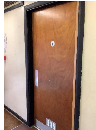
Girls – toilets near the hall.